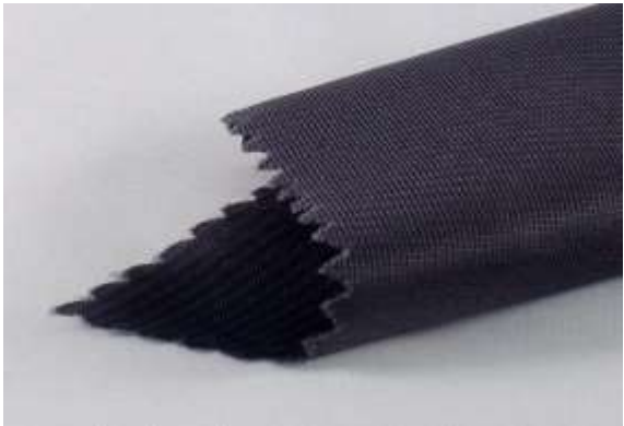
2980 Warp Knit Polyester Weight: 116-136g/m2 Width: MIN 187cm

Since the foundation of the company in 1831, innovation has been at the heart of our business. In 2010 the company won the TI World Conference prize for innovation. The company has also won two Queen's Awards for International Trade. With more than 188 years of experience, Baltex is shaping the future of technical textiles.