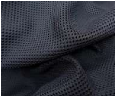
5712 Polyester Mesh Weight: 380-420g/m2 Width: 150-160cm