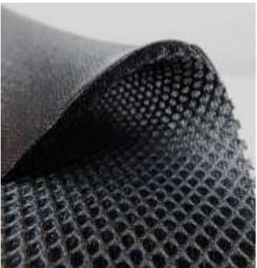
M8950 Polyester 3D Mesh Weight: 265g/m2 Width: 140cm