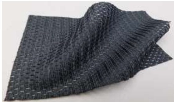
3910 Coolmax Mesh Weight: 200-220g/m2 Width: 160-170cm