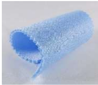
7716 Polyester Mesh Weight: 130-140g/m2 Width: 140-143cm